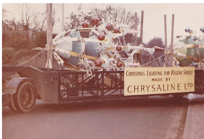
Christmas lights leaving Eddy Street on the slow journey to Central London

The rest, as they say, is history, leading to displays all over the country, from neighbouring Oxford Street, to Glasgow and the Blackpool Illuminations as we know them today. Most people who visited 'Ashridge House Illuminated' over Christmas would not have been aware that were it not for a company based in Berkhamsted, the evolution of such displays would have started much later.