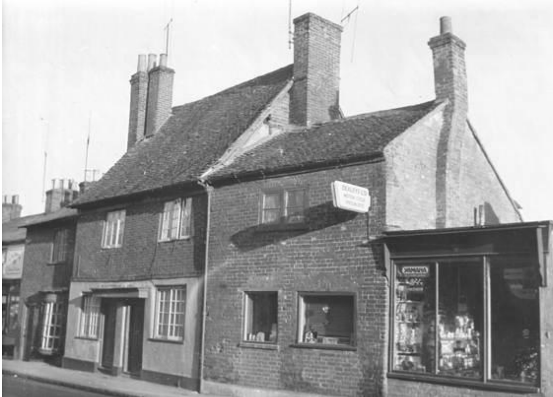
61-64 Gossoms End 1971