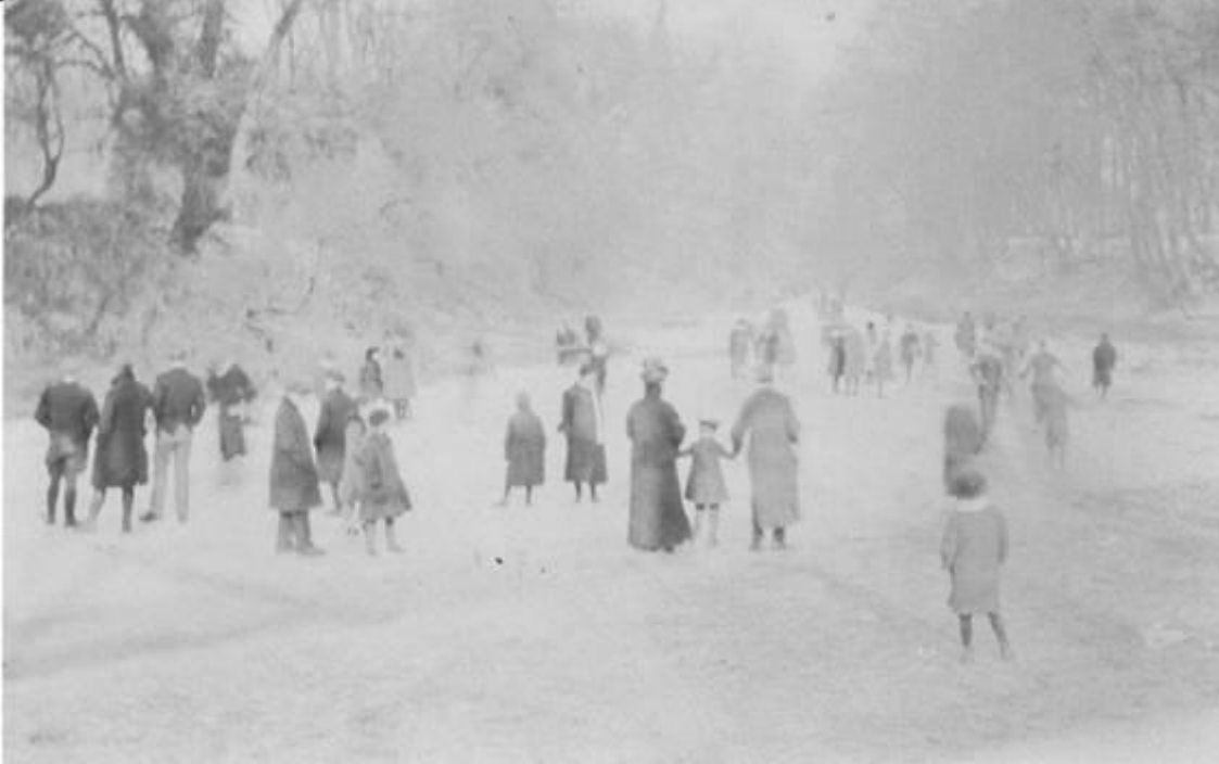
Skating in the Castle Moat 1890