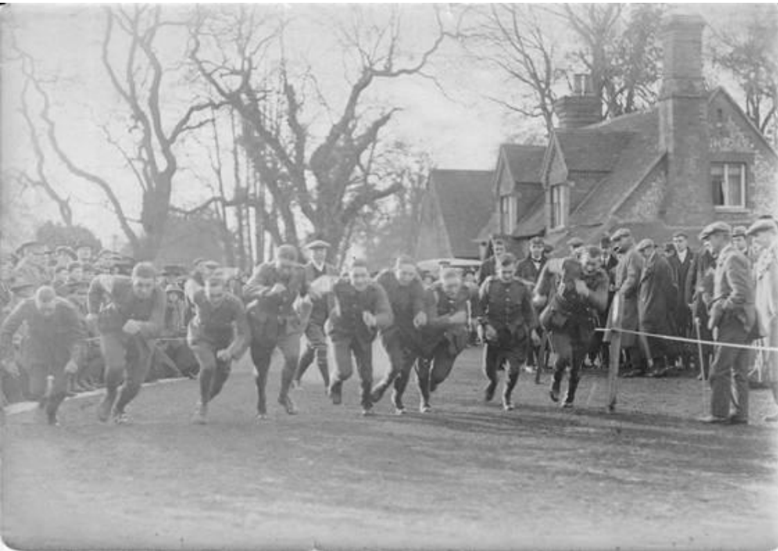
Race in the Castle grounds March 1915