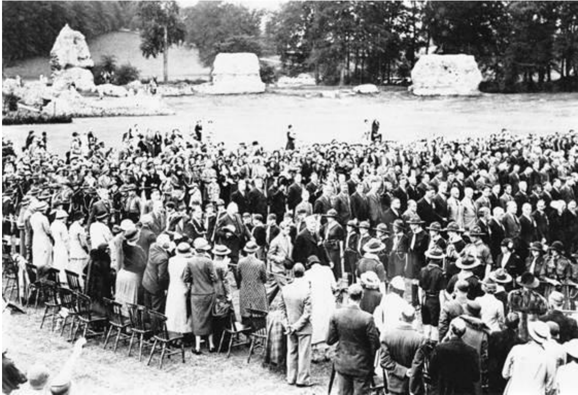
Edward, Prince of Wales, inspecting ex-servicemen in the castle grounds 1935